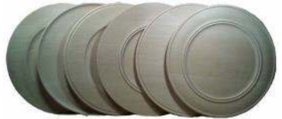
A B C D E F