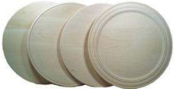
G H I J