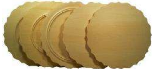
K L M N O