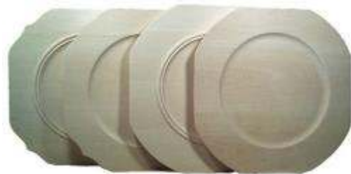
P Q R S