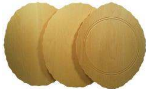
T U V